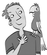
work with animals